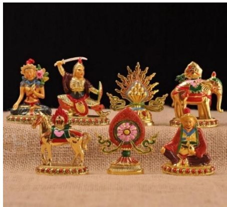
Picture 3: Seven kinds of treasures ( The Precious Wheel, Precious Jewel, Precious Queen, Precious Minister, Precious Elephant, Precious Horse, Precious General, and the great Treasure Vase. )

What kind of wisdom do we need? We need Dharma wisdom, study wisdom etc. We visualize that our butter lamp offering is so big that it reaches Mount Meru and in this way, we get merits.